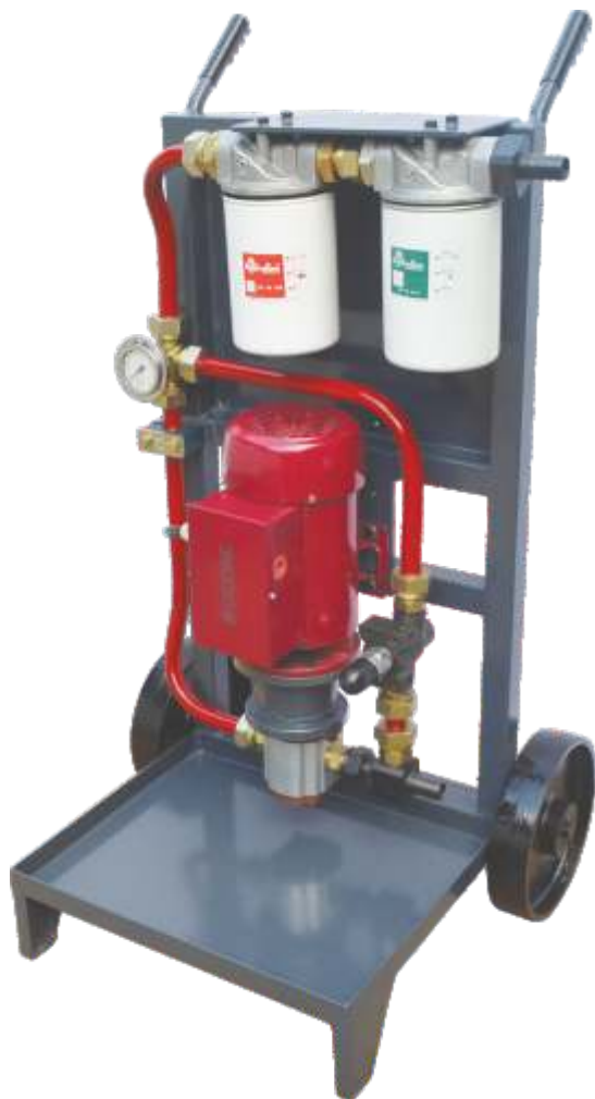
Oil Filtration & Transfer System (10 micron, 20 l/min)