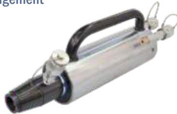
Hydraulic Wedge Lock Arrangement