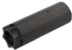
Extended Nose Fixture