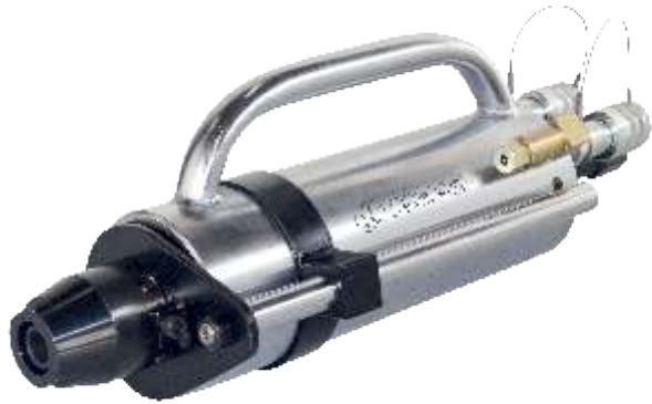
Mechanical Wedge Lock Arrangement