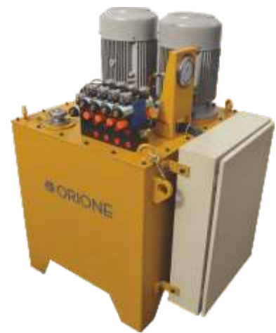
Dredger - Ship building