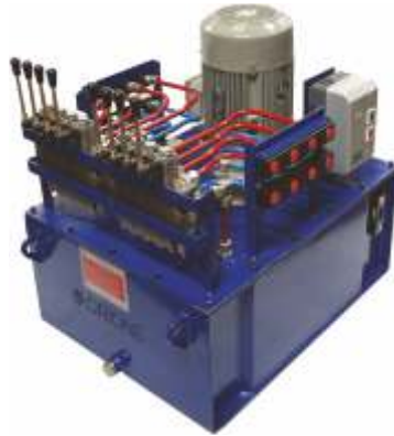
Girder Mould Form - Construction