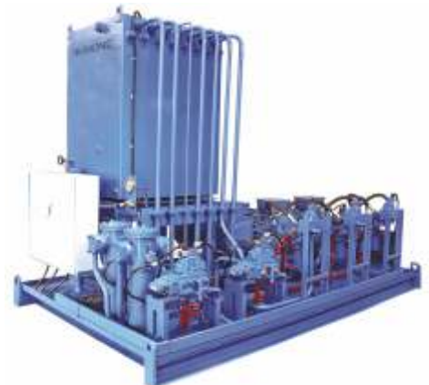
Slag Pot Car - Steel Plant