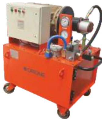
Crane cylinders testing