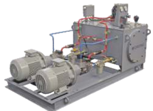
Sheet Stretching - Automobile