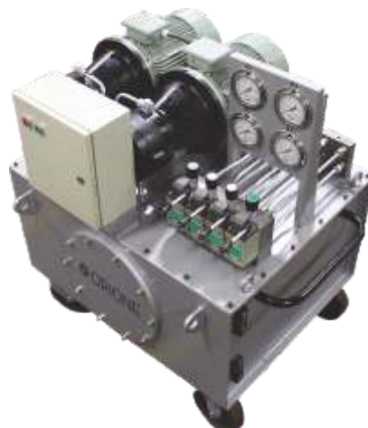
Synchro-lift (Split flow) - Pile Breaker