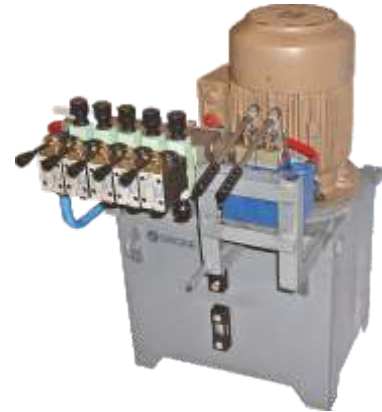
Positions Tuyere handling trolley - Steel plant