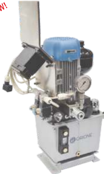
Yaw Brake - Wind Mill