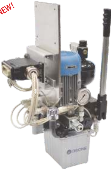
Rotor Brake - Wind Mill