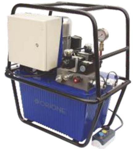
Multi Strand - Wind Mill Tower