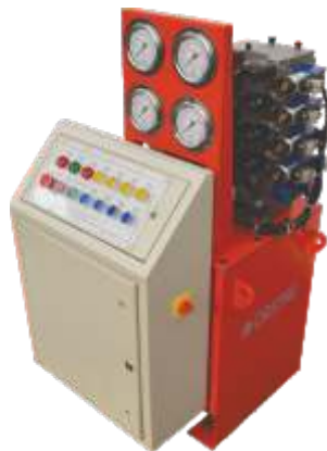
Large Size Pipe Bending Machine