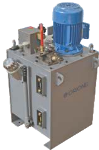
Lamination Curing Presses