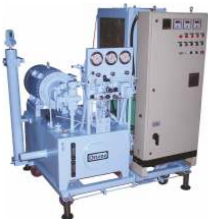
BARC - R&D