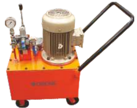
Sugar Mill Cylinder Testing