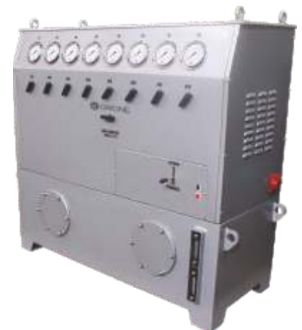
8 Station, heavy lifting