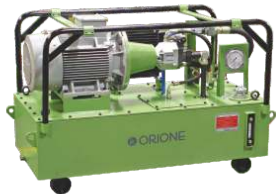
Air oil cooler - CNC Machine