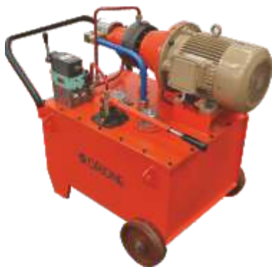
Steel Mill Cylinder pressure testing