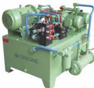
High Speed Moulding Presses