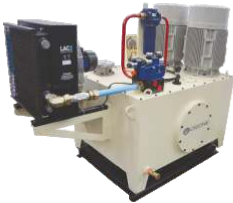
Boiler Fuel Grate