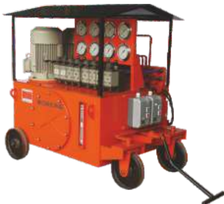
Jacking - Ship building / repairs