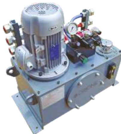
Propel Mechanism - Crawlers