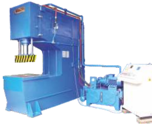
100 ton Semi Automatic PLC Metal Forming Press (With Electronic pressure flow and stroke control)