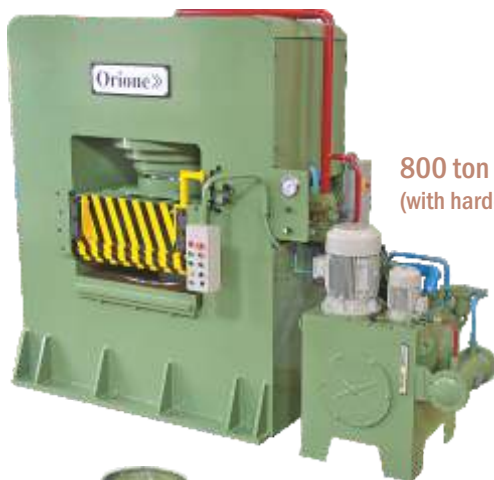
800 ton Forming Press (with hardened wear plates)