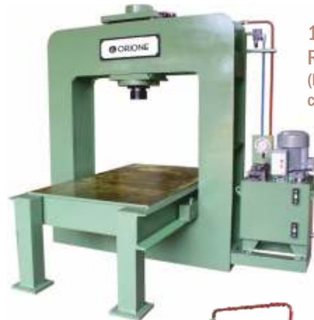
100 ton Hydraulic Roll Bed Press (Manual travel of cylinder & frame)