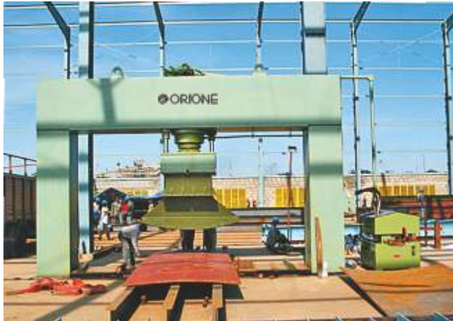
500 ton Metal Forming Press (Ship building industry)