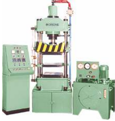
50 ton Semi Automatic Double Daylight Press (Electrically heated platen)