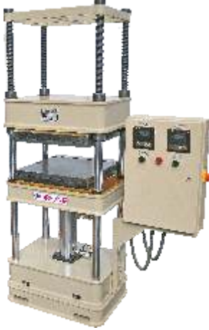
20 ton Lab Press (Electrically heated platen)