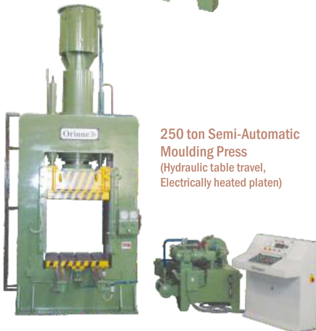
250 ton Semi-Automatic Moulding Press (Hydraulic table travel, Electrically heated platen)