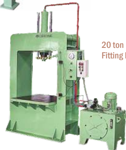
20 ton Bush Fitting Press