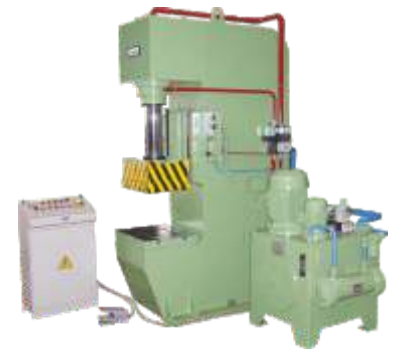
150 ton Metal Forming Press