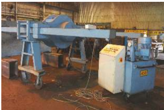
400 ton Horizontal Press (Steel plant - shaft dismantling)