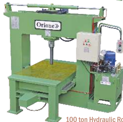
100 ton Hydraulic Roll Bed Press (Hydraulic travel of cylinder & frame)