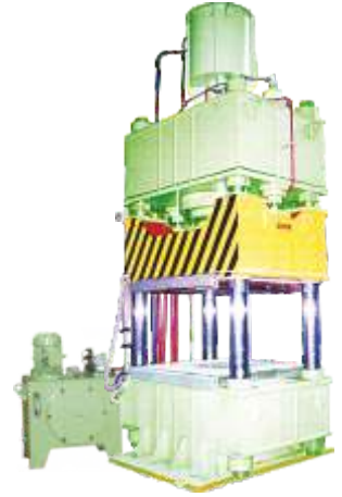
600 ton Semi Automatic Moulding Press (Electrically heated platen)