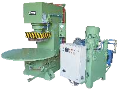
100 ton 3 Station Indexing Press, Semi Automatic