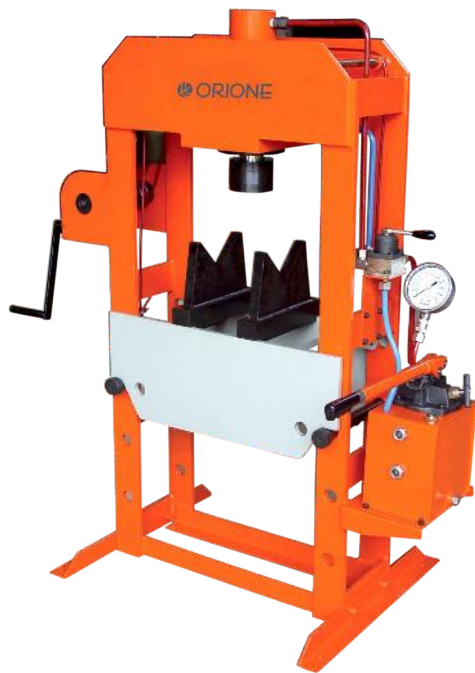
Hand Pump Operated

Capacity 15 - 500 ton | Max. Working Pressure 700 bar