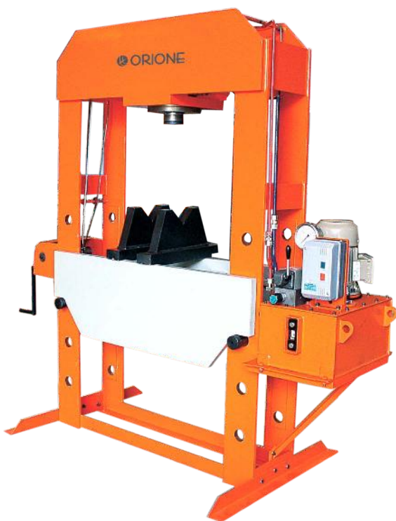
Power Pack Operated